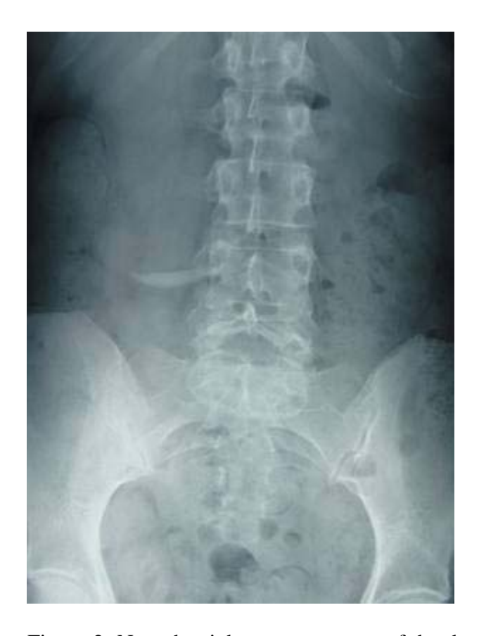
Figure 2: Note the right rotatory curve of the thoracolumbar spine on the anteroposterior view.