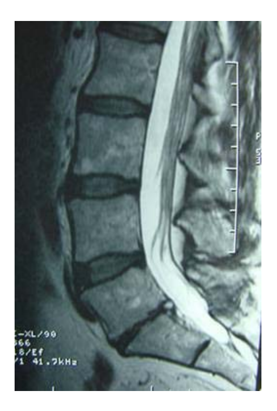
Figure 4: On this T2 weighted sagittal image again note the L5-S1 disc degeneration with the posterior high intensity zone. Note the patency of the vertebral canal and good space and hydration of the discs superior to the L5-S1 level.