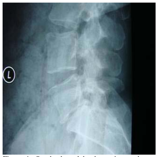
Figure 1: On the lateral lumbar spine study, note the post-surgical L5-S1 disc space which shows advanced degenerative change and possible posterior endplate hypertrophy.