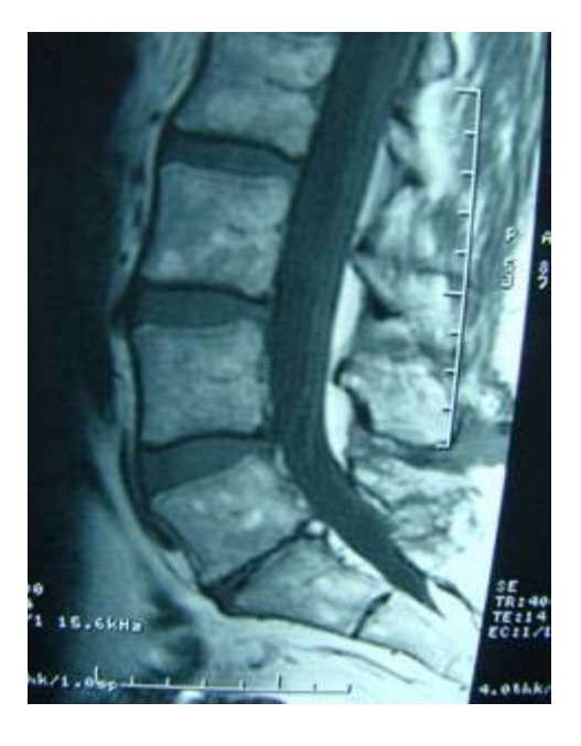
Figure 3: Note the advanced discogenic spondylosis at the L5-S1 disc level with the high intensity zone within the posterior disc space. This is a T1 weighted image. This is a post-surgical microdiscectomy which failed to relieve this patient's back and right leg pain.